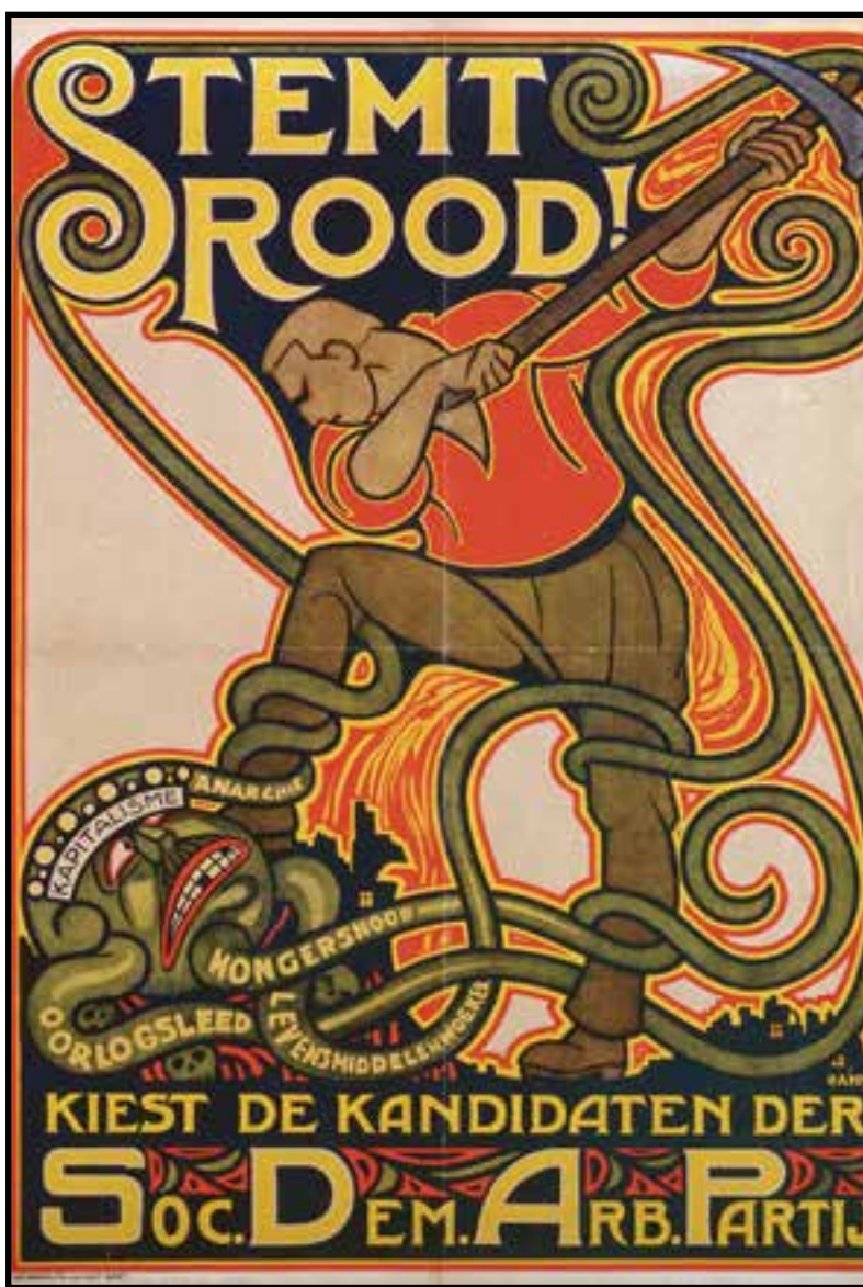
Netherlands: Social Democratic Workers Party (1918)

For instance, the ideal of worker-owned and -operated production is a petty bourgeois democratic fantasy. It neglects the fact that, as Marx observed, the conditions for industrial production are not essentially the workers’ own