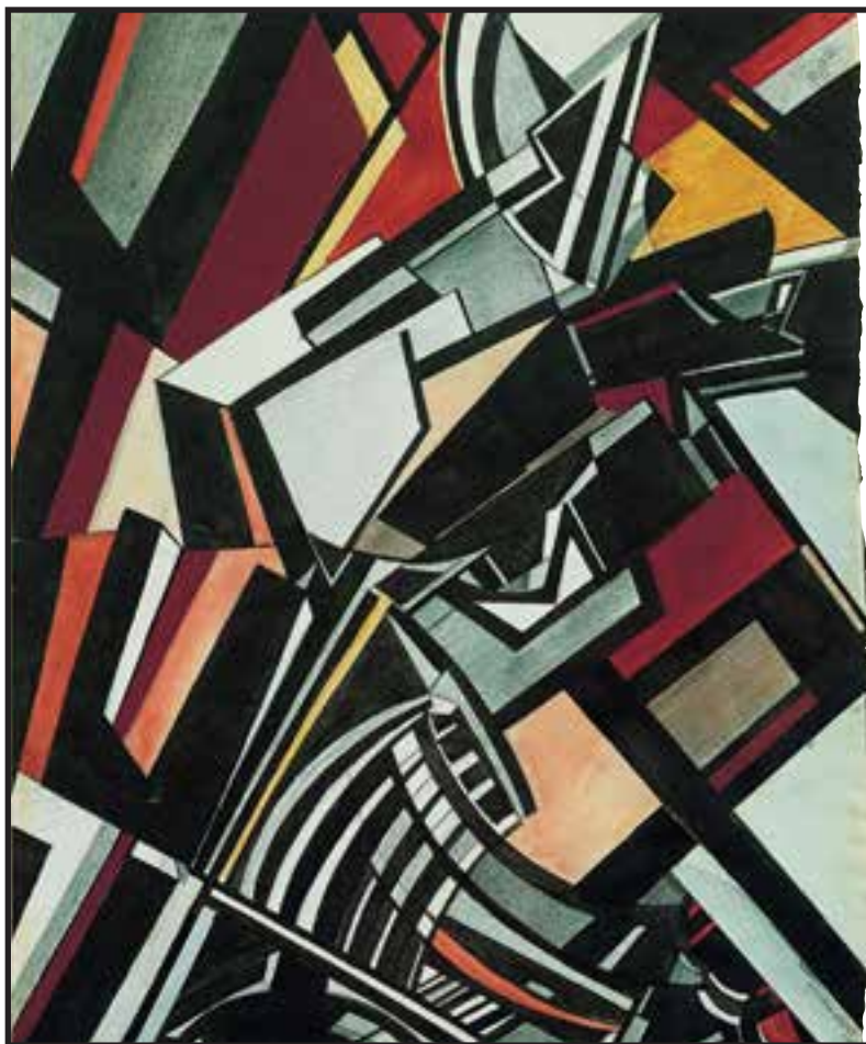
Conflict and contradiction