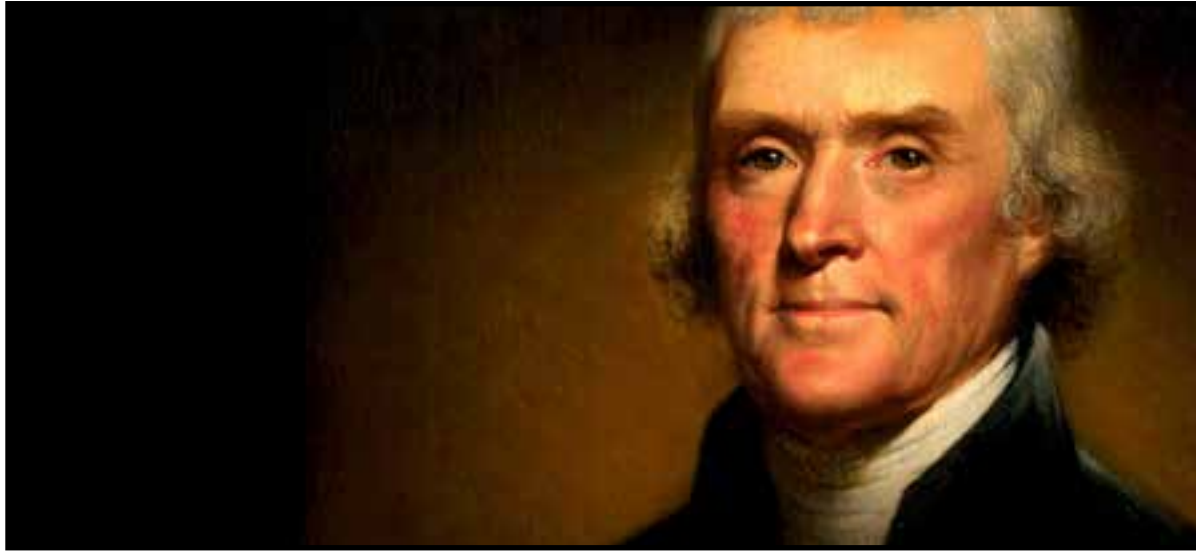
Thomas Jefferson: anti-slavery